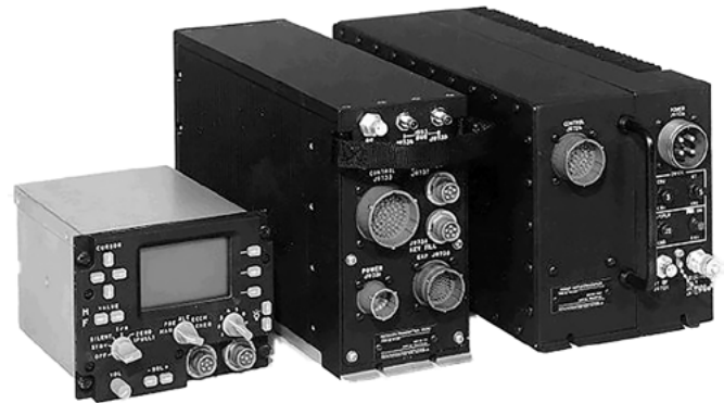
Figure 18-4. Built In Test Equipment (BITE) Indicators.

An example of a database requiring updating is the navigation database which forms a part of the Flight Management System. The navigation database contains a great deal of information used by the flight crew. This includes the location of airports, airways, way points, and intersections, the location and frequencies of radio navigation aids, and other information needed to create and follow a flight plan. Because changes to this information occur from time to time, the navigation database requires periodic updates. These updates are uploaded through the data loading system. The standard frequency for navigation database updates is every 28 days. Figure 18-7 shows examples of navigation database update software.