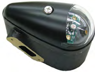
Figure 15-8. A forward position LED position light from Devore Aviation.

Small aircraft are usually equipped with a simplified control switch and circuitry. In some cases, one control knob or switch is used to turn on several sets of lights. For example, one system utilizes a control knob, the first movement of which turns on the position lights and the instrument panel lights. Further rotation of the control knob increases the intensity of only the panel lights.