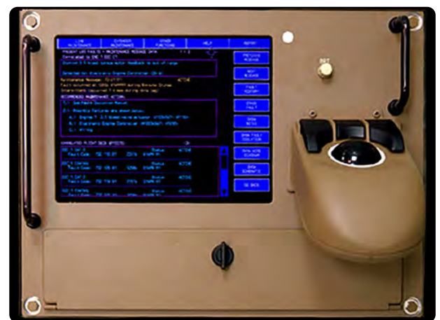
Figure 18-5. Maintenance Access Terminal (MAT).