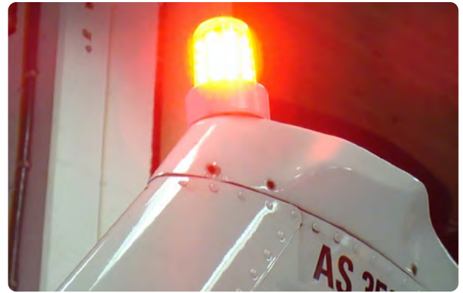
Figure 15-9. A typical anti-collision light installation in a vertical stabilizer.

Rotating beacons are usually installed on top of the fuselage or tail and/or under the fuselage. Each is installed in such a location that the light does not affect the vision of the crew member or detract from the visibility of the position lights. Figure 15-9 shows a typical anti-collision light installation in a vertical stabilizer.