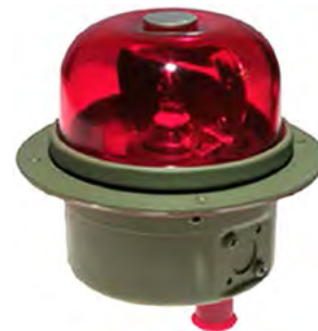
Figure 15-10A. A V-shaped reflector over the axis of a single sealed lamp.

Another type of beacon illustrated in (Figure 15-10B) employs two filament lamps, mounted in tandem, each of which is pivoted on its own axis. One half of each